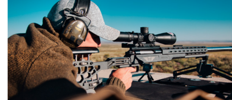
📍 Tony Ingram, Day 1, 2 nd May at 08:26