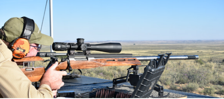
Deon Fabel, Day 2, 3 rd May at 08:35