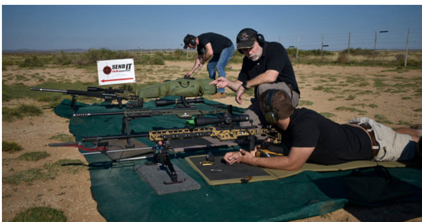
1 Zero Range, 1 st May 2024 Send IT ULTRA 2024