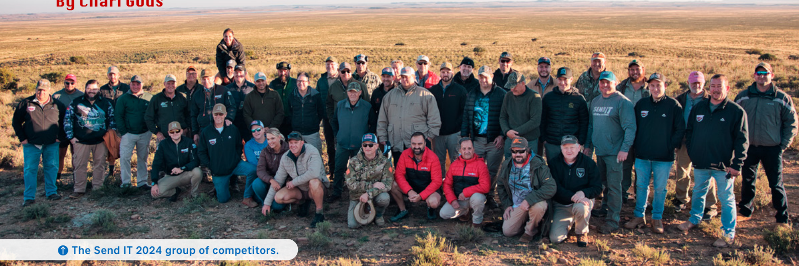
1 The Send IT 2024 group of competitors.